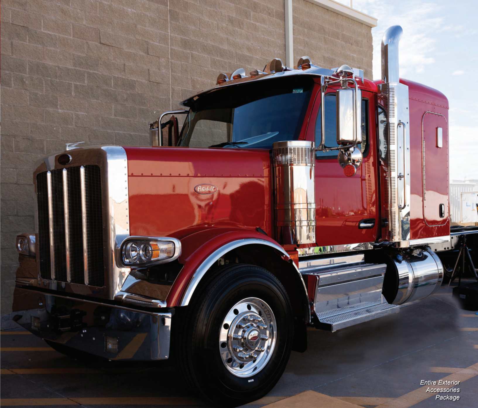
Entire Exterior Accessories Package

Cover- Air Cleaner (Rear Pair): R22-6454-2110