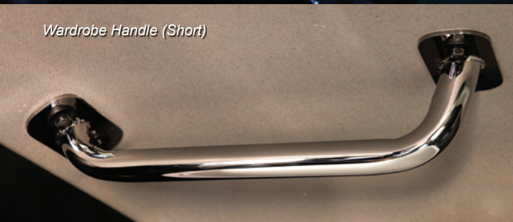
Wardrobe Handle (Short)