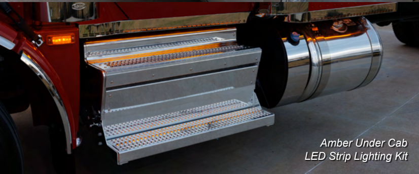
Amber Under Cab LED Strip Lighting Kit