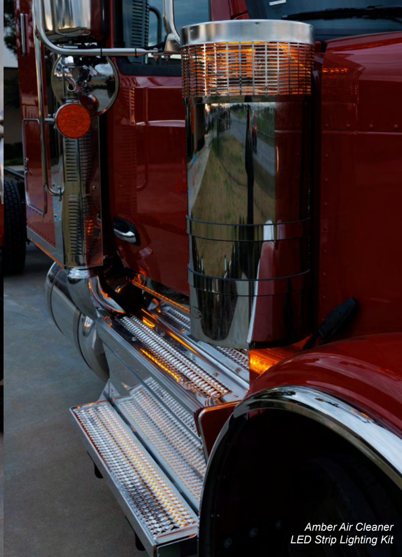
Amber Air Cleaner LED Strip Lighting Kit