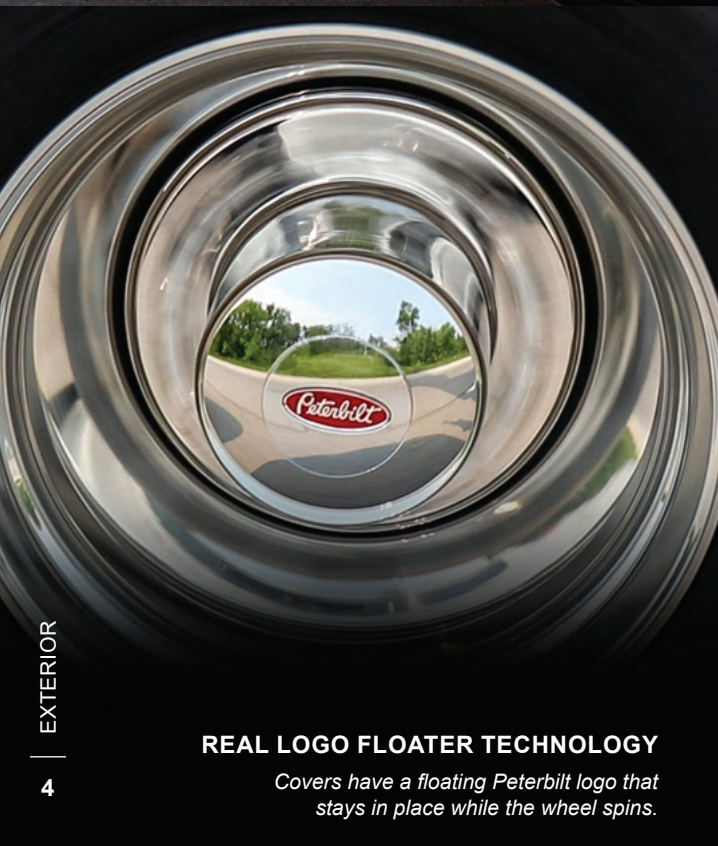
Steel Axle Cover Kit and Fenderettes