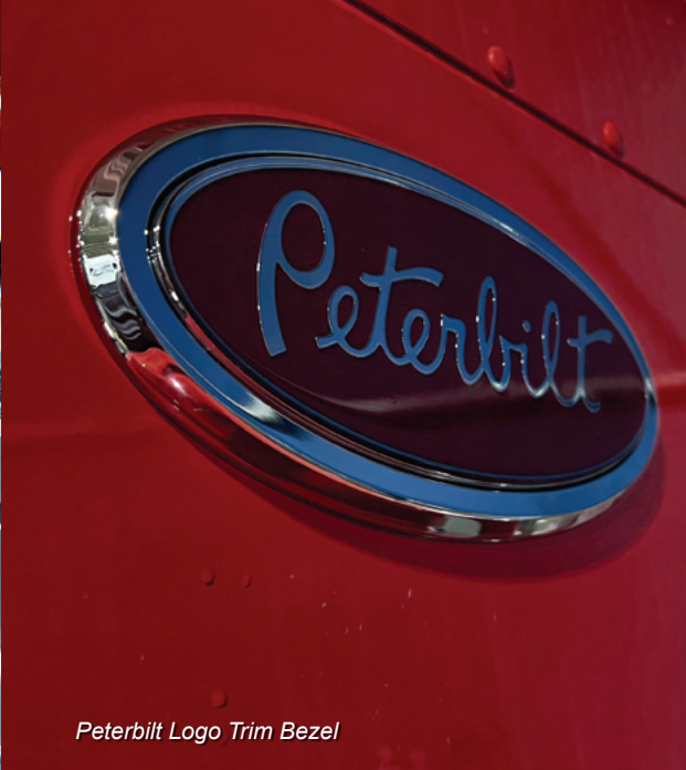
Peterbilt Logo Trim Bezel