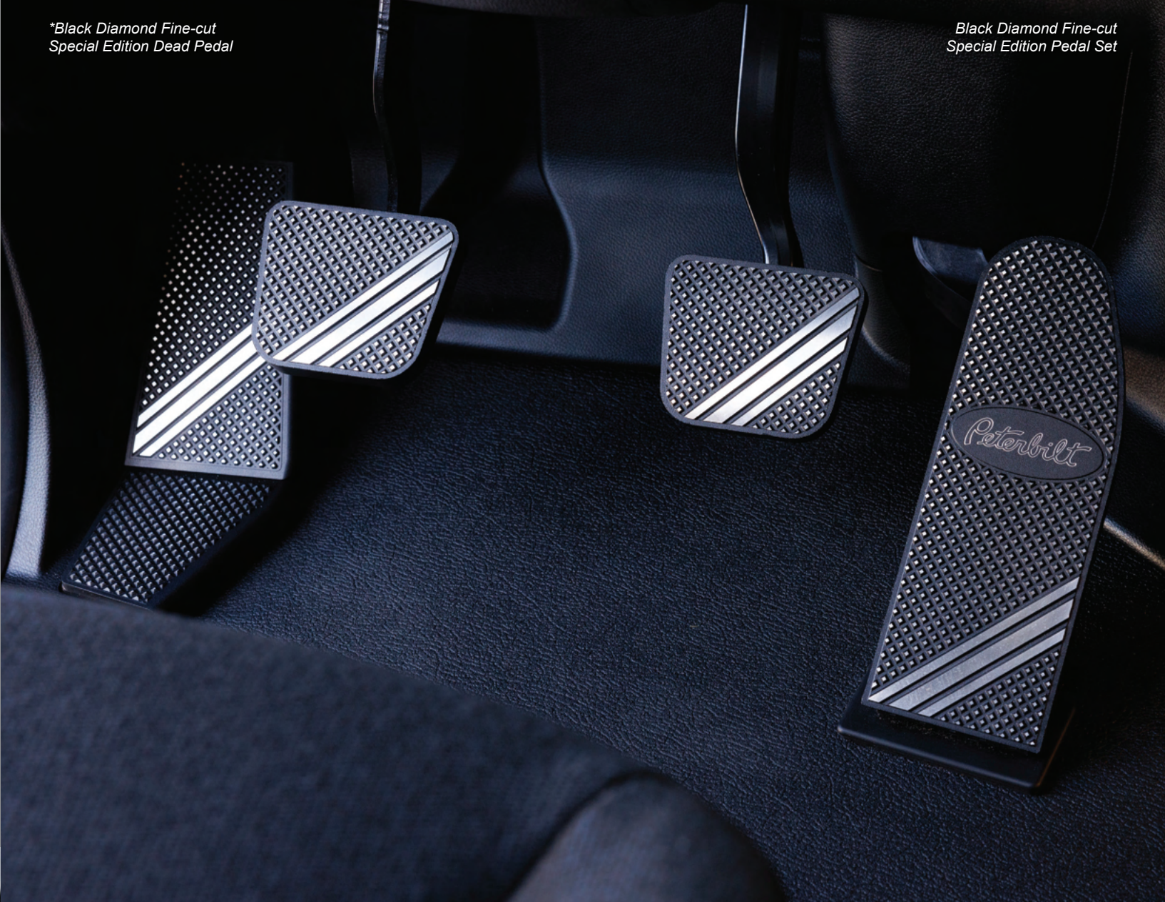
*Black Diamond Fine-cut Special Edition Dead Pedal

*Dead Pedal Variation Used on Truck Before March 2024.