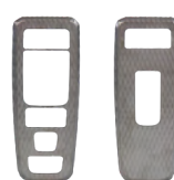
Window Bezel Trim