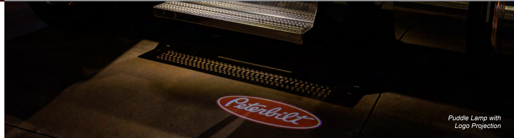
Puddle Lamp with Logo Projection