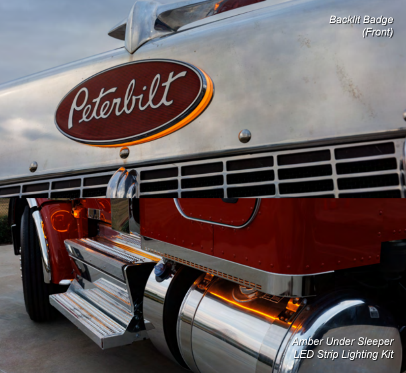
Backlit Badge (Front)