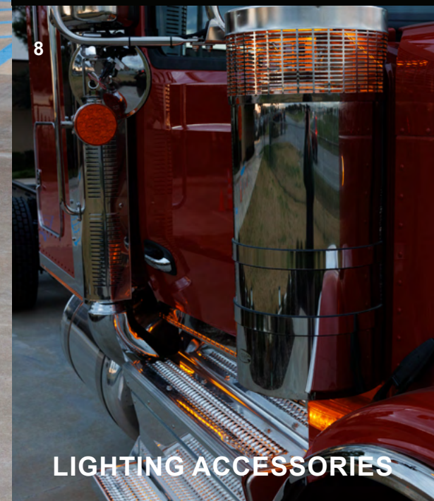
8 LIGHTING ACCESSORIES