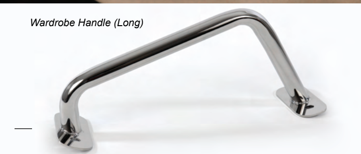
Wardrobe Handle (Long)