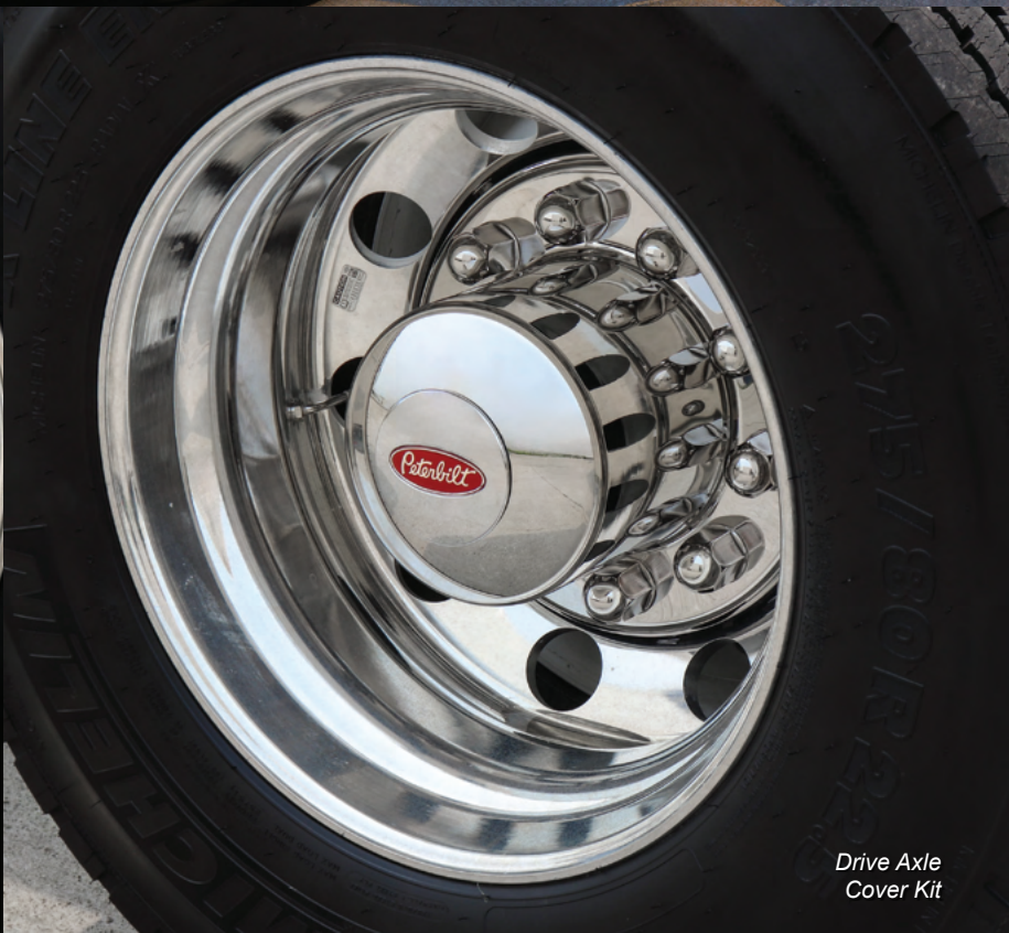
Drive Axle Cover Kit

Covers have a floating Peterbilt logo that stays in place while the wheel spins.