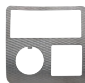
D-Panel Incert (Ignition)