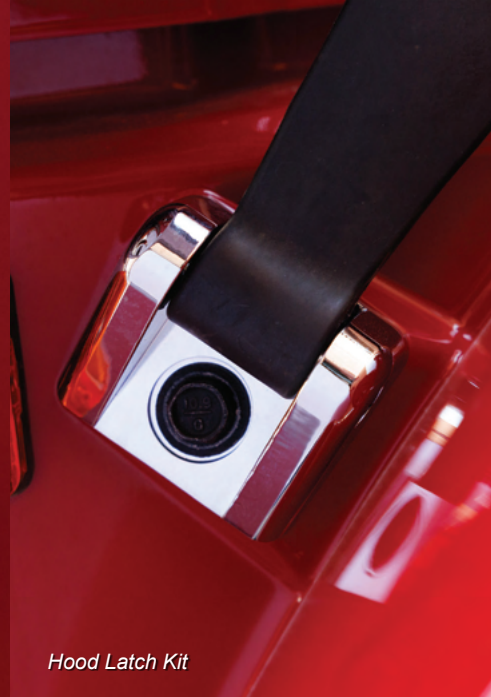
Hood Latch Kit