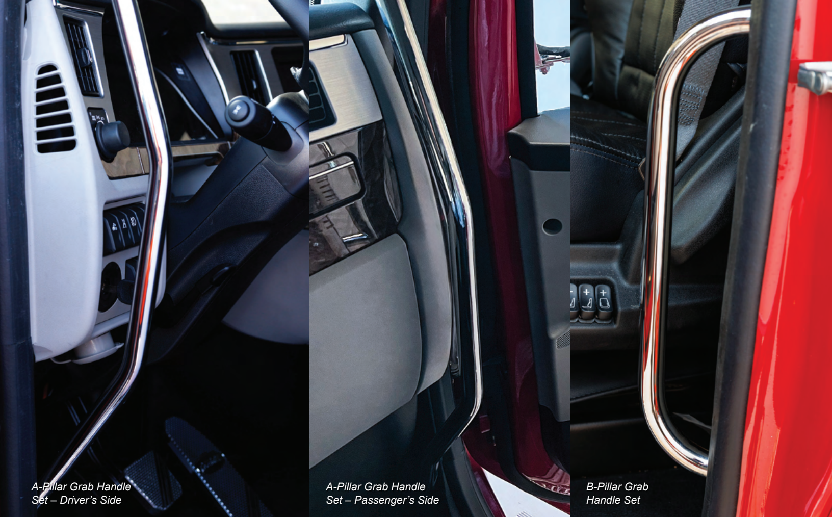
A-Pillar Grab Handle Set – Driver's Side