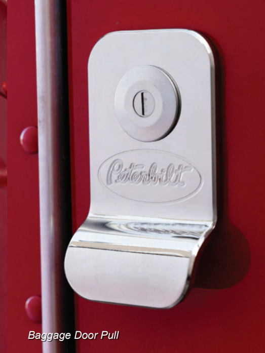
Baggage Door Pull