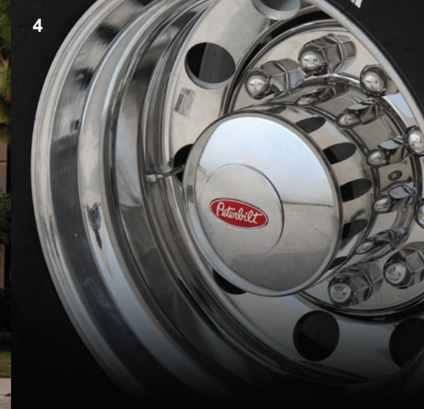
4 EXTERIOR ACCESSORIES