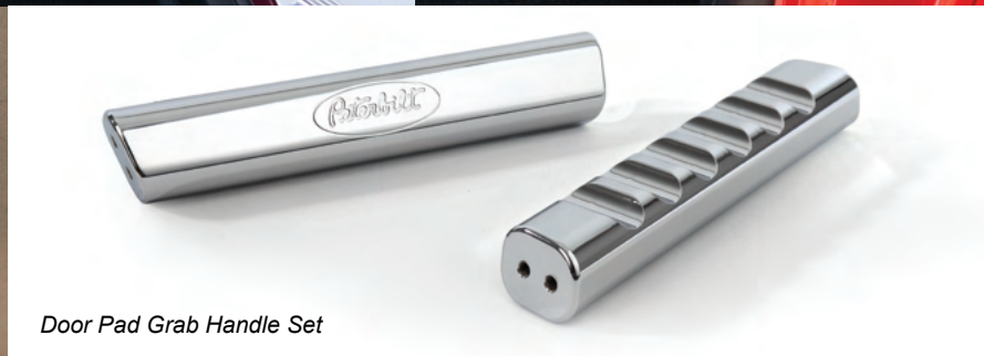
Door Pad Grab Handle Set