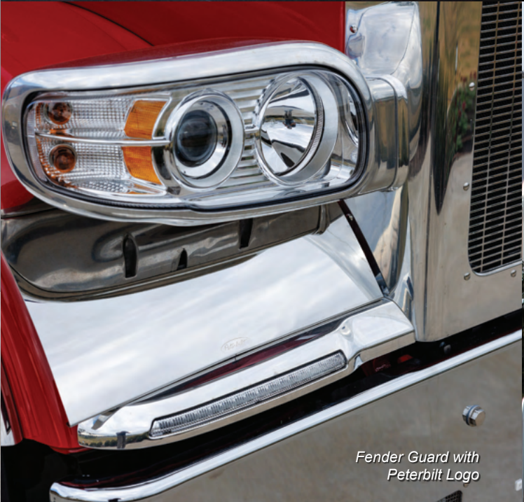
Fender Guard with Peterbilt Logo