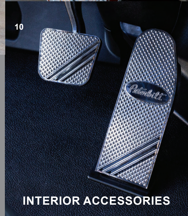
10 INTERIOR ACCESSORIES