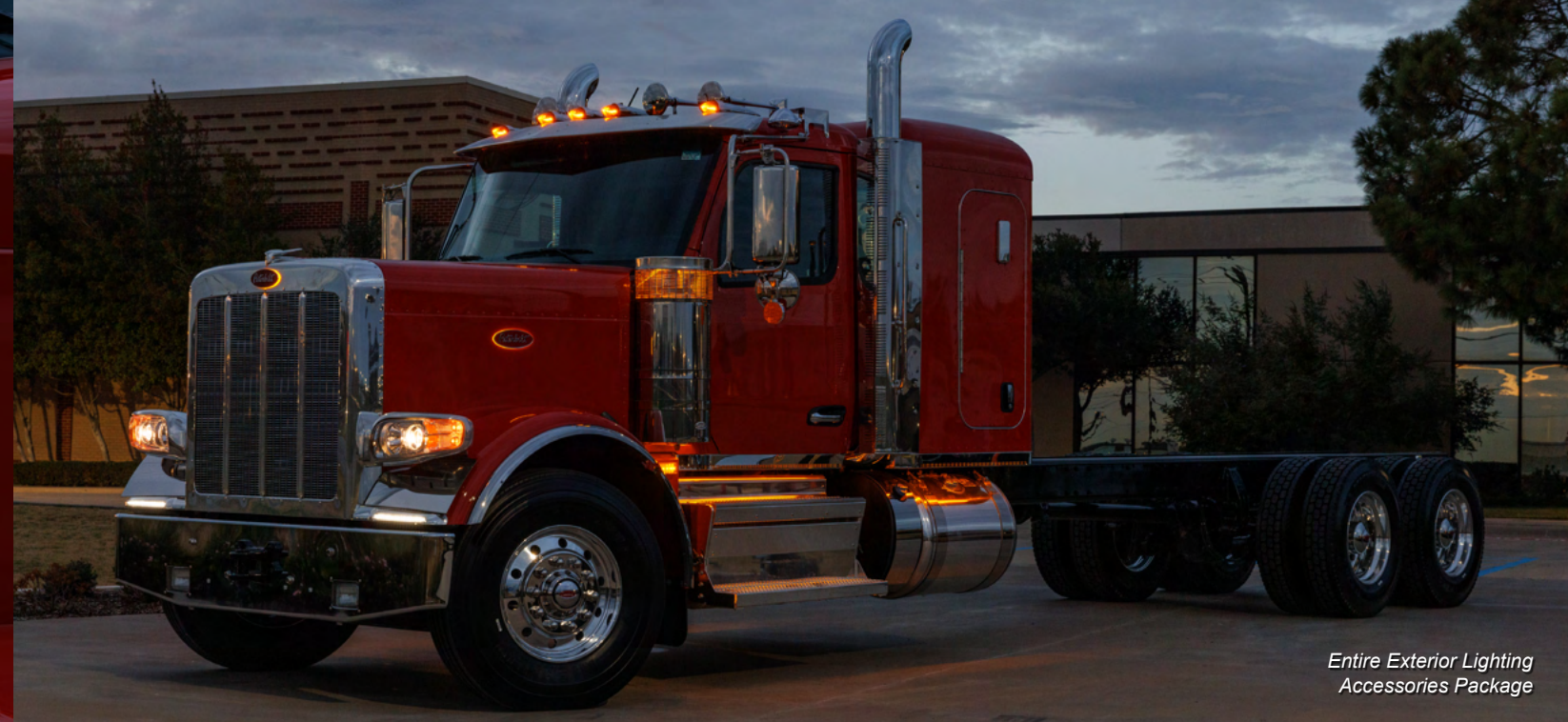
Entire Exterior Lighting Accessories Package