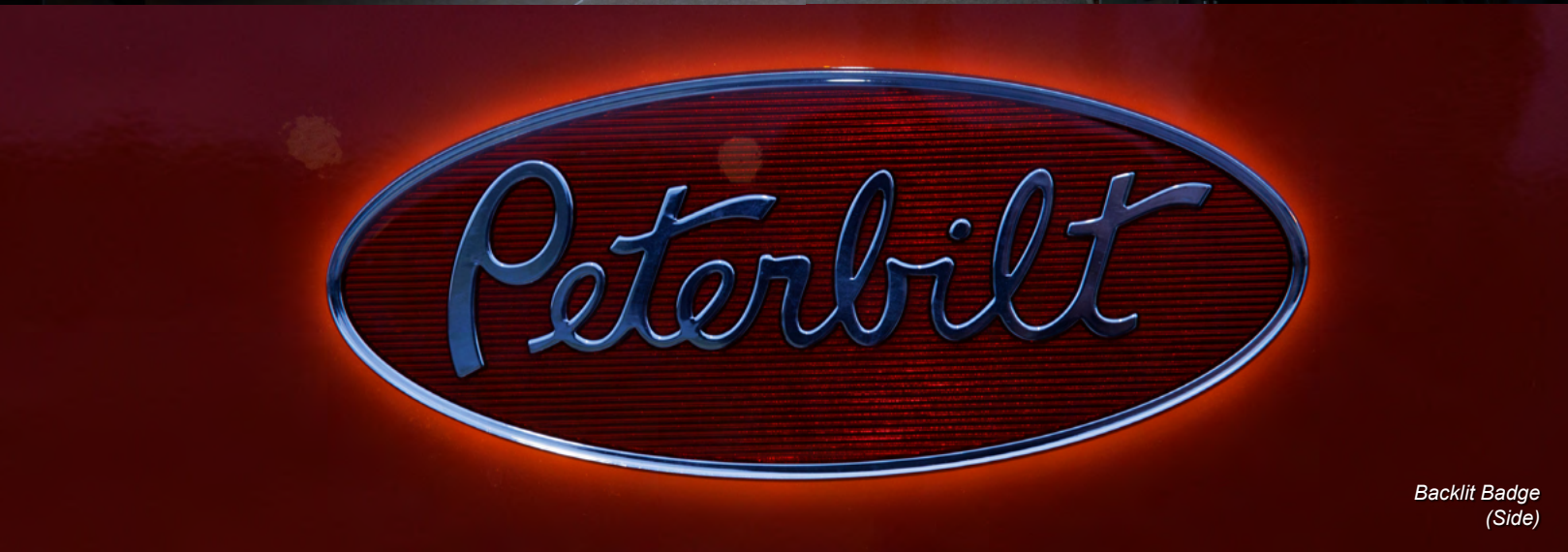
Backlit Badge (Side)